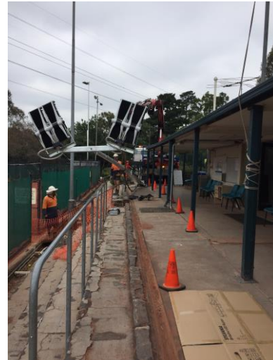
Carefully maneuvering the pole into position