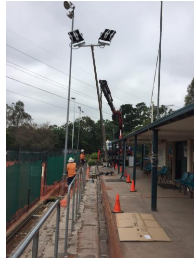
Sorting out the cabling & LED driver in the Pole