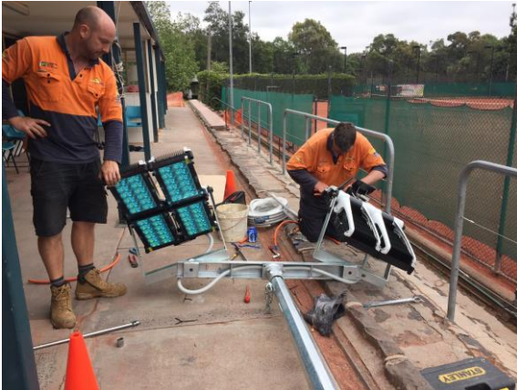
Attaching the LED light bank to the pole